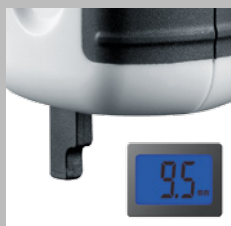
Tread depth measurement with digital display