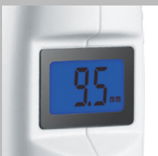
Illuminated LC display