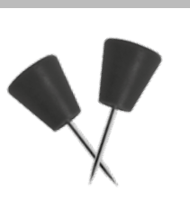
Special pins for fastening