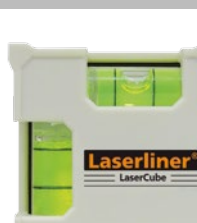
Easy alignment via vials