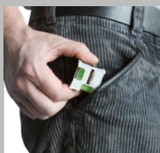
Practical cube housing