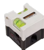
LaserCube + batteries